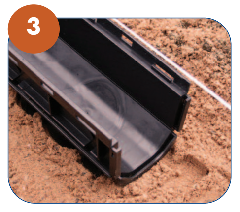
Start installation at lowest point of the run to accommodate any cut lengths which should be installed at the point furthest from the outlet.