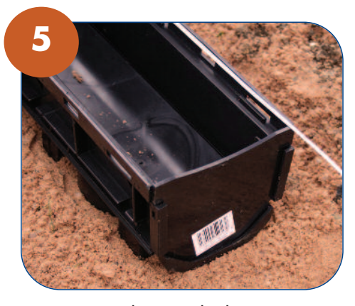
Use an End Cap at highest point of FloDrain.

It is advisable to use silicone sealant for the FloDrain joints & end caps.