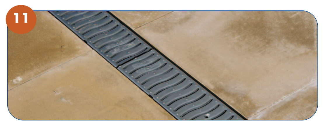
✓ If installing block paving or paving slabs, haunch around channel with concrete to a height which allows the depth of the block or slab to finish 2mm above the level of grate.