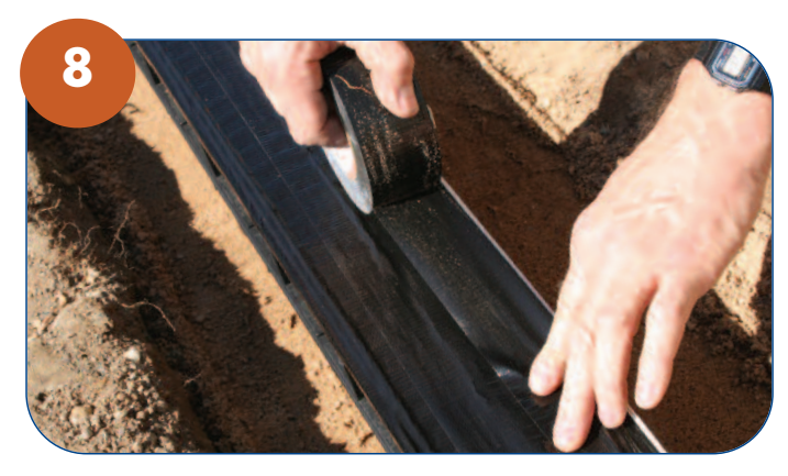
✓ Protect grate with tape before concrete is poured.