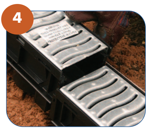
Join two lengths of channel by interlocking them at each end.