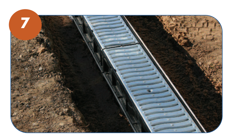
✓ Install with grate.