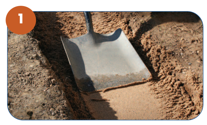
✓ Dig trench for FloDrain, allowing for 50mm deep compacted sand base and wide enough for a minimum of 100mm backfill of concrete on each side.